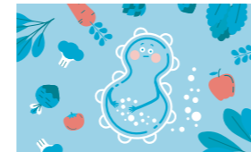
How to Prevent Bloating After Eating