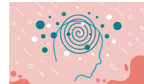
Find Out If Nausea is a Symptom of IBS