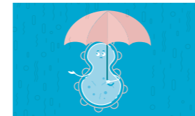
The Best Foods for Leaky Gut