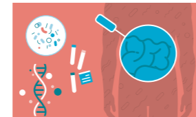
Gut Health Testing – All Your Questions Answered

Head to the healthpath.com blog for the latest health insights, including: