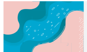
The Lowdown on Dysbiosis