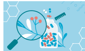
Everything You Need to Know about Supplements